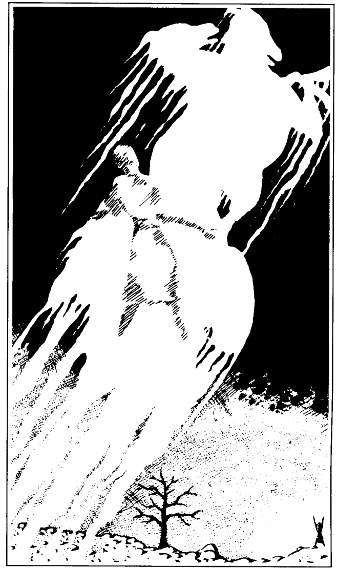
Elijah is taken up in a whirlwind by a fiery chariot and horses.

"Maybe we should go search for him," one of the men suggested. "He may be alone and hurt on some