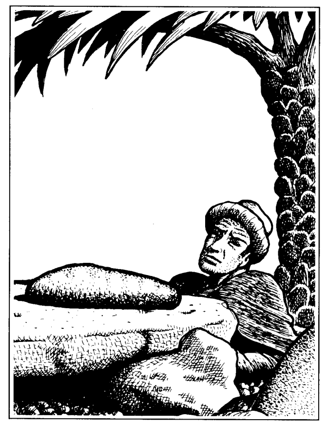
Elijah awoke to see a loaf of freshly baked bread and a container of cool water.

While Elijah was sleeping, the angel again touched him and said, "Arise and eat, for you will be going on a long journey."